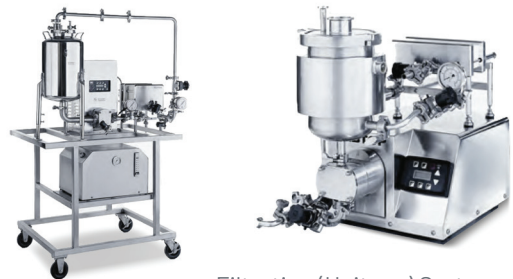
Filtration (Units or) Systems

LABTOP features a compact and highly mobile design perfect for filtration, chromatography, pilot applications, R&D and more. LABTOP makes your pumping activities simple and efficient. Each LABTOP is composed of a Unibloc pump, a motor and controller enclosed in a stainless-steel canopy, with bidirectional flow for versatility. Unibloc offers three versions of the LABTOP: the 200 Series, the 300 Series and the 400 Series.