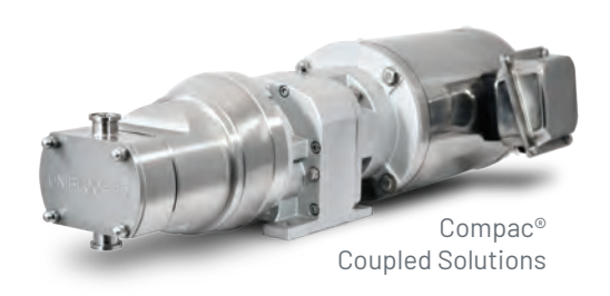
Jacketed Pump Heads